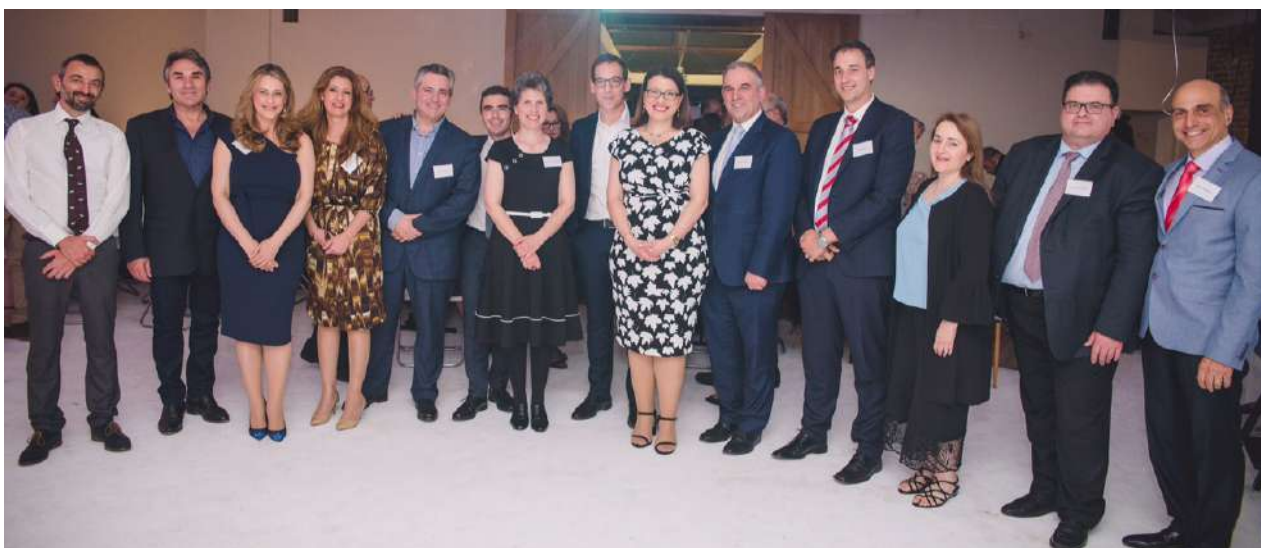
The Hon Jenny Mikakos MP & Steve Dimopoulos MP, together with HMSA Board members at the very successful HMSA 2019 End of Year Event.

I would like to wish you all a very Merry Christmas, a safe and Happy New Year and a restful and reflective Holiday Season. Please enjoy this edition of Hygieia.