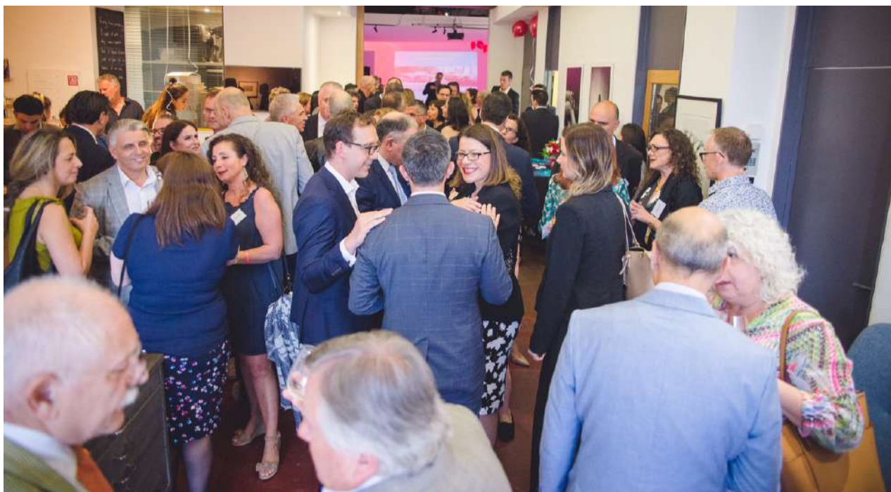
A snapshot of HMSA members and special guests mingling on the night