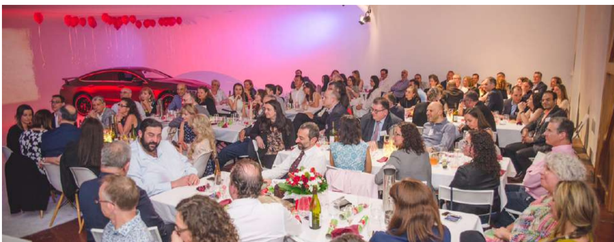
Some of the attendees at the HMSA End of Year event. Note the awesome Mercedes prestige car backdrop, that formed part of the "Auction" on the night, for our successful winners of the HMSA "Drive the Range" winery event on Friday Feb 7th 2020.