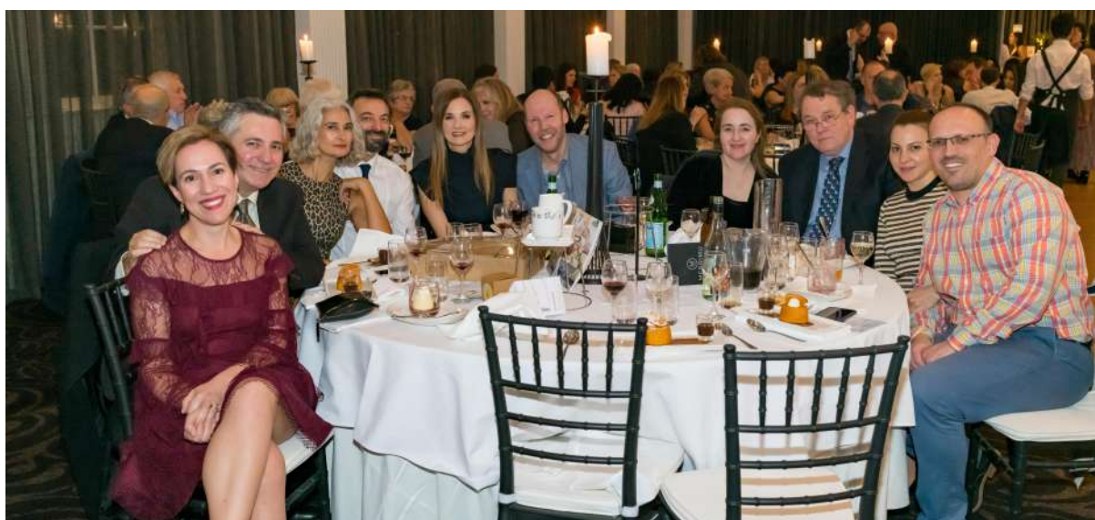
The HMSA table

Click here to view the event gallery on the HMSA website