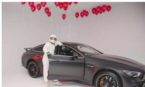
'The Stig' with the prestige car on display in the venue