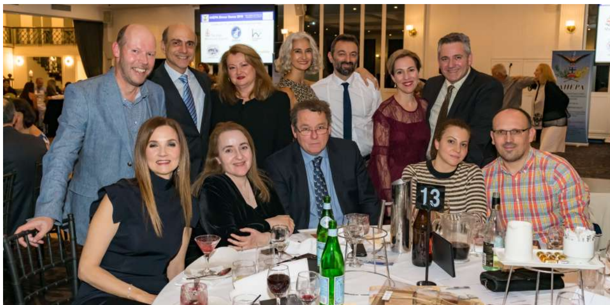
The HMSA table

If you would like to donate or find out more about this initiative, please go to https://doyourownthing.everydayhero.com/au/greek-australian-travelling-fellowship