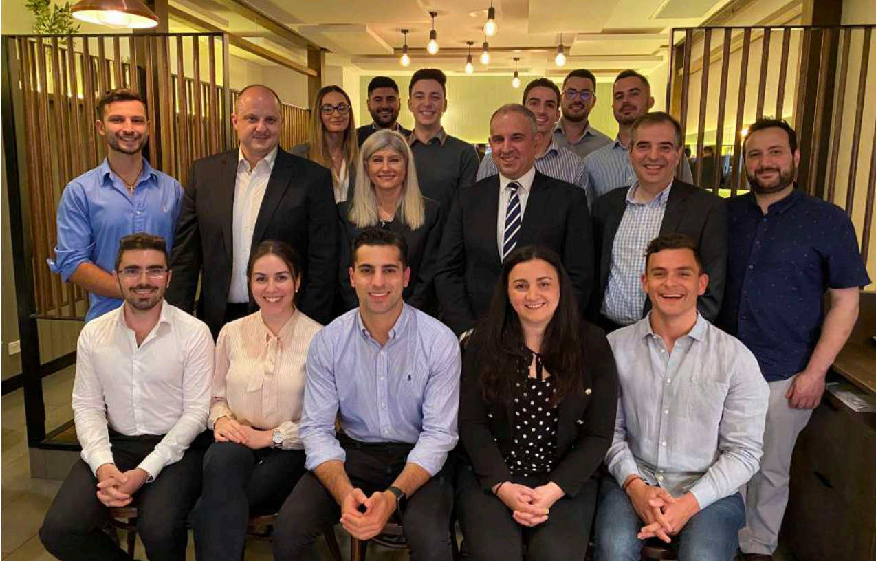
Doctors in Training and HMSA members attend DIT-specific networking dinner at Elia Greek Tavern, February 2020

The dynamically changing landscape of 2020 due to coronavirus has seen many changes to pre-determined plans for the year so far, and junior doctors of the HMSA have been no exception. Within the DiT subdivision of the HMSA, the main activity of the year to date has been a DiT-specific networking dinner held in February at Elia Greek Tavern in Heidelberg. This was the largest HMSA DiT event to date, and was made possible with the kind support of Delphi Bank, who